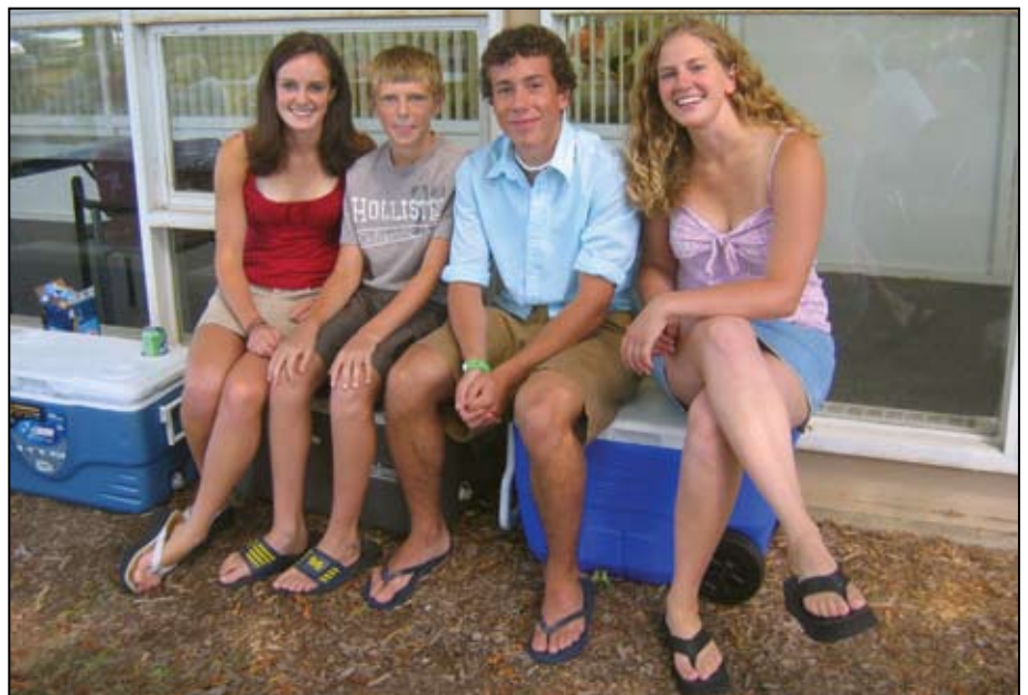
Student volunteers take a break during the Annual Picnic in August.